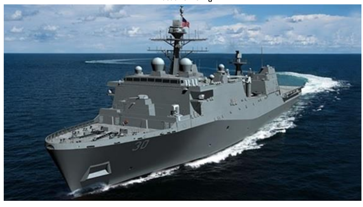
Figure 2. LPD-17 Flight II Design

Compared to the LPD-17 Flight I design, the LPD-17 Flight II design ( Figure 2 ) is somewhat less expensive to procure, and in some ways less capable—a reflection of how the Flight II design was developed to meet Navy and Marine Corps operational requirements while staying within a unit procurement cost target that had been established for the program. In many other respects, however, the LPD-17 Flight II design is similar in appearance and capabilities to the LPD-17 Flight I design. Of the 13 LPD-17 Flight I class ships, the final two (LPDs 28 and 29) incorporate some design changes that make them transitional ships between the Flight I design and the Flight II design.