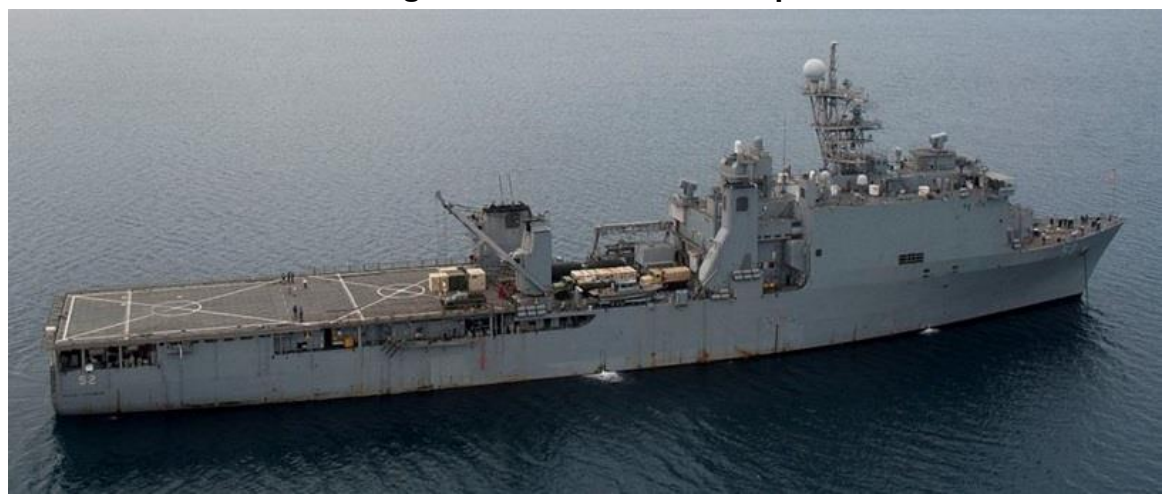
Figure 1. LSD-41/49 Class Ship