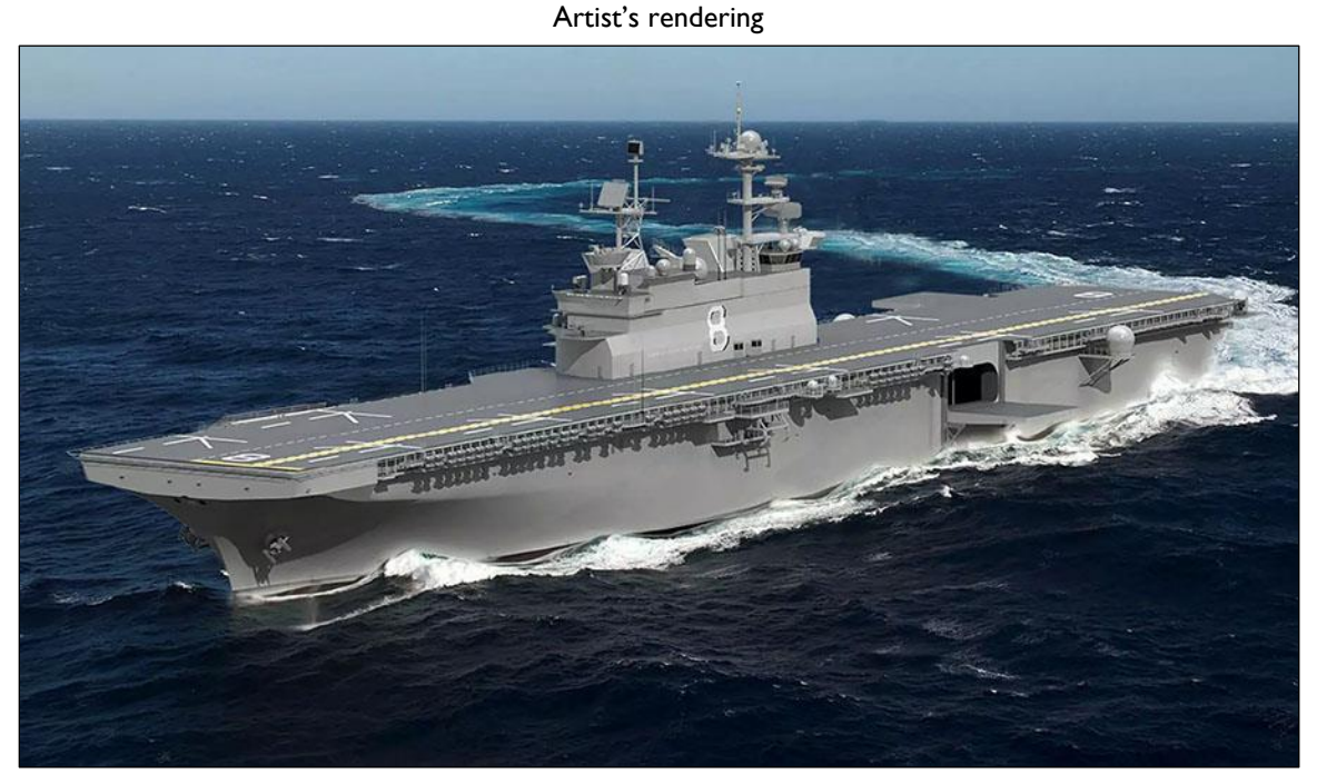
Figure 3. LHA-8 Amphibious Assault Ship

LHA-type amphibious assault ships (Figure 3 and Figure 4) are procured once every few years.