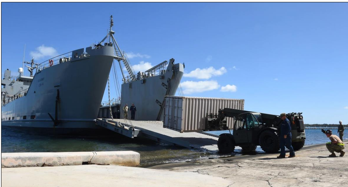
Figure 3. Besson-Class Logistics Support Vessel (LSV)